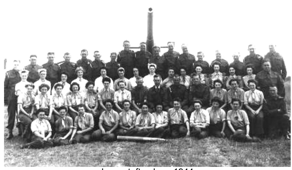
Lowestoft – June 1944 B Section 516 (M) H.A.A. Battery