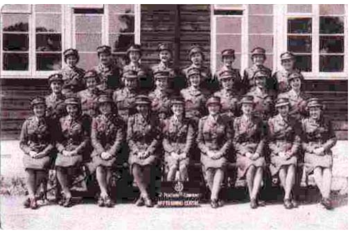
Golders Green 40 9D Course, July 1944