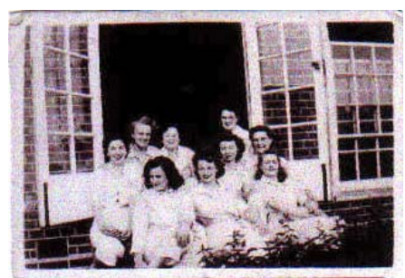
Beryl Centre front.