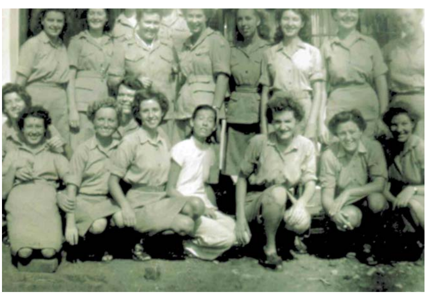
ATS snapsot No 2 Coy, Changi, Singapore May 1946