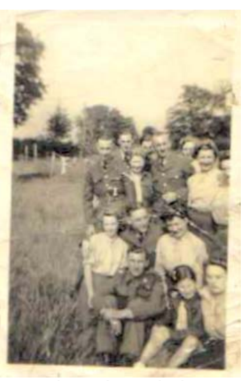
Aircrew cadets. I married one on his return from Canada. Had his wings and posted to a Lancaster Sqn Cheveralls Green 1943