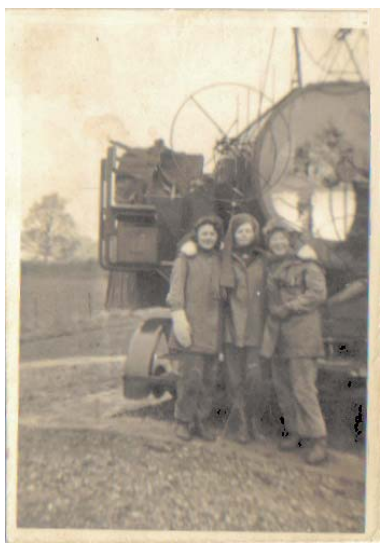
Cheveralls Green 1943