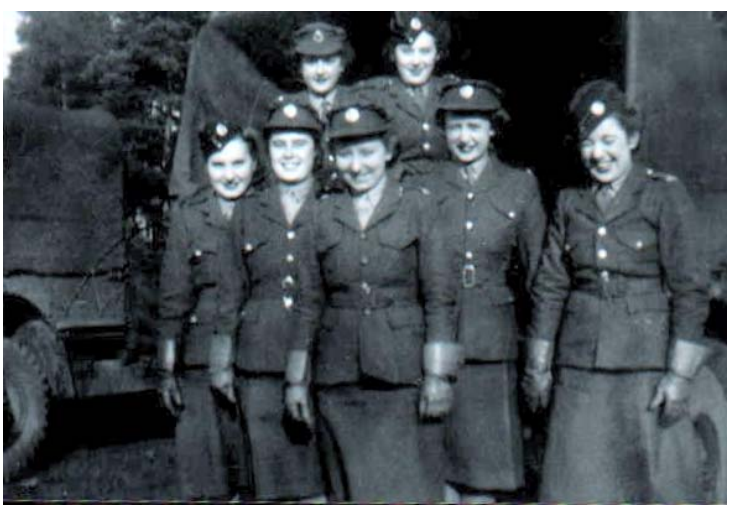
No 1 M.T.T.C. Camberley, Surrey 1943