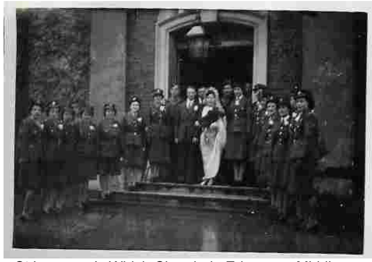
St.Laurance's Which Church, in Edgeware Middlesex