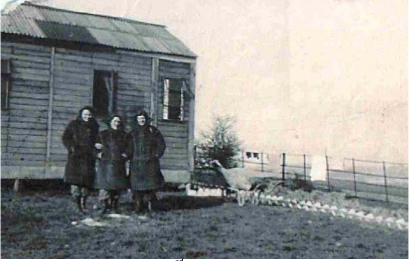
342 Battery 93<sup>rd</sup> Searchlight Regiment Hunton Bridge