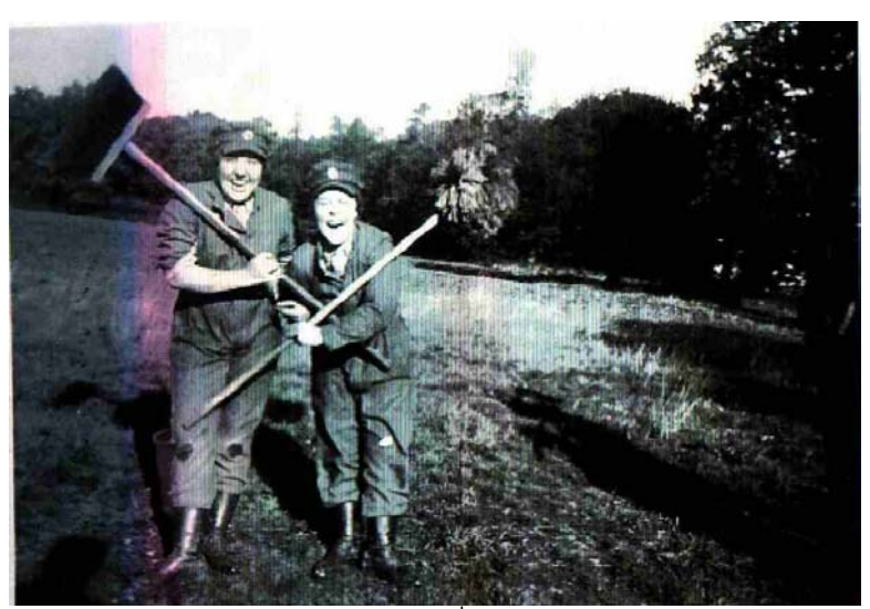
Girls from 342 Battery 93<sup>rd</sup> Searchlight Regiment Hunton Bridge