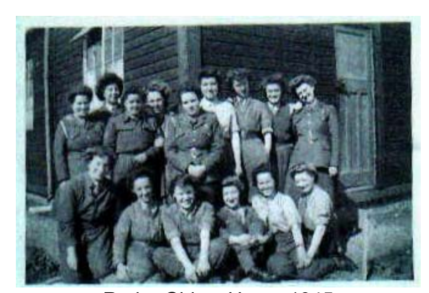
Radar Girls – Upnor 1945