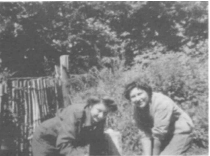
Cleaning out the cess pit