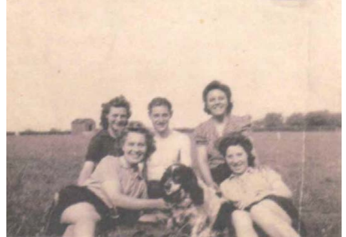
We had just done PE The fellow is the electrician who would come on site when needed