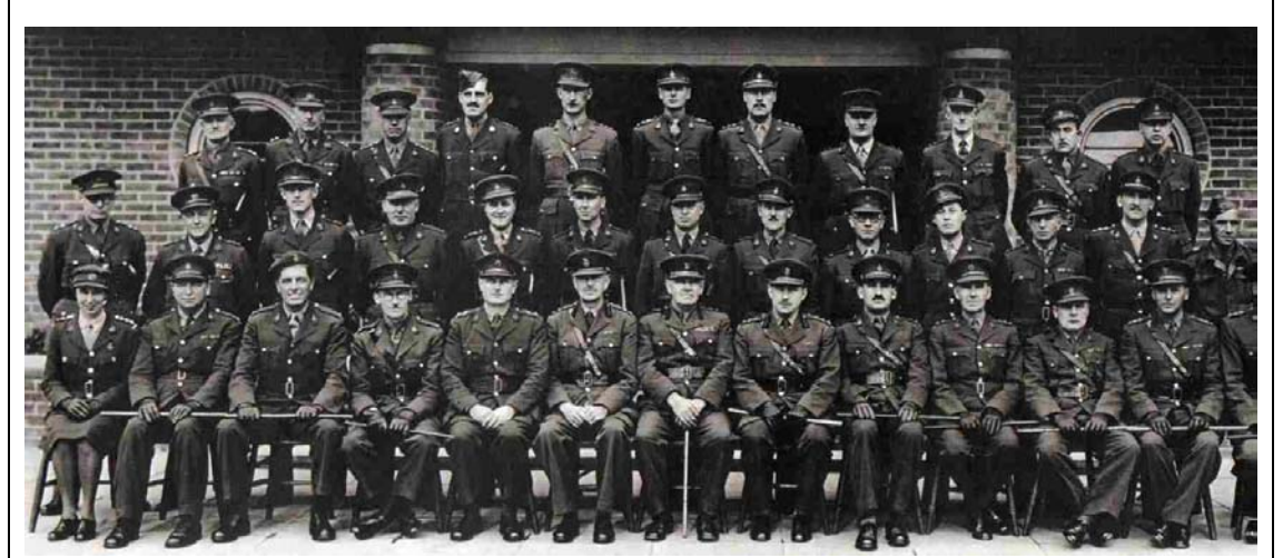
Army Catering Corps Training Centre October 1943