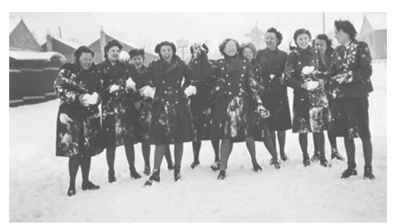
Sherford Camp 1946, Heavy snowfalls – water rationed – heat non existent in the huts, so we warmed up with snowfights! Everyone pitched in, even the Officers