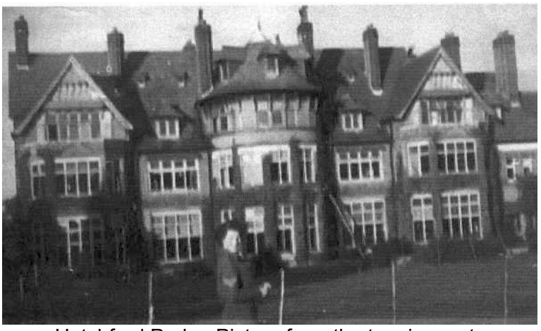
Hatchford Park - Picture from the tennis courts