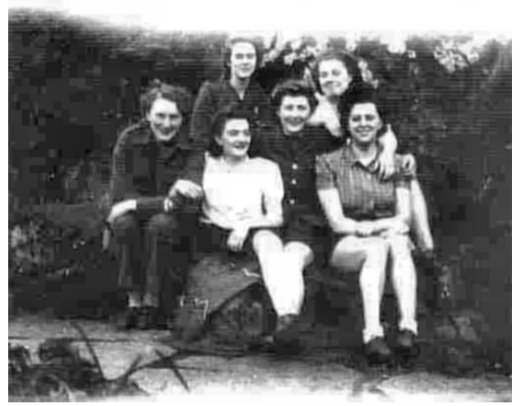
Group of H.Q. A.T.S. taking it easy with the P.T. Sgt