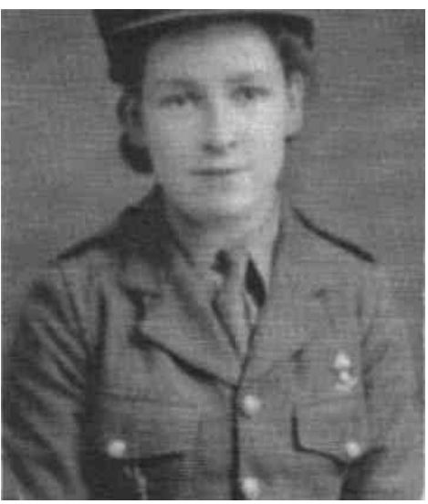
Rookie - November 1944