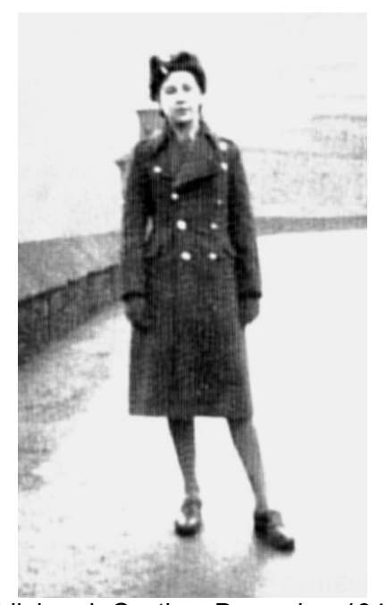
Edinburgh Castle – December 1946