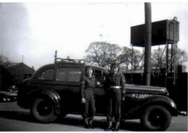
L/Cpl Cornes with a friend standing next to a Humber Snipe Staff Car Gresford Driver Training School 1947