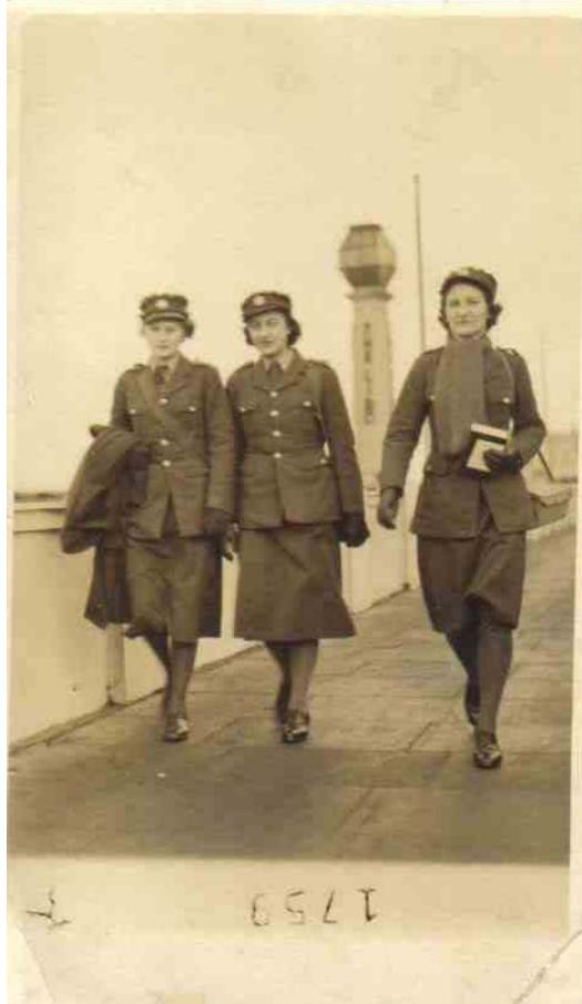
Cliftonville HQ 2 nd Echelon – Margate 1940