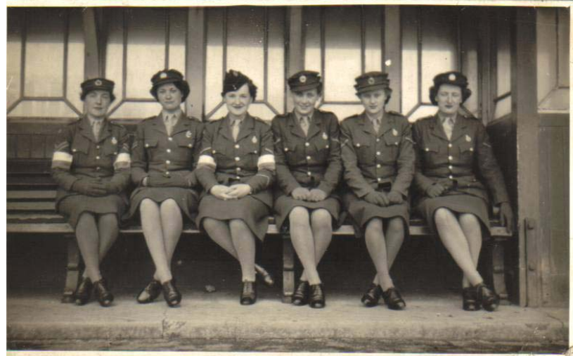
Southbourne ATS Signal Training School 1941