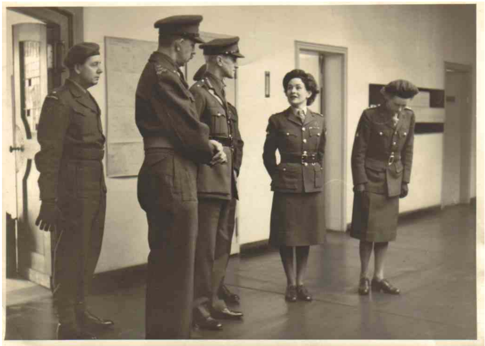
Rhine Army HQ 21 Army Group Director of Signals Germany Visit 1949