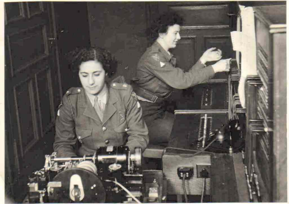
Rhine Army HQ 21 Army Group Signals Office 1949