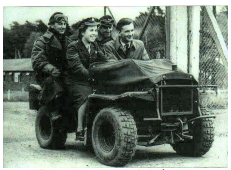
Taken at 'Longcross' by Daily Graphic Fighting Vehicle Proving Establishment