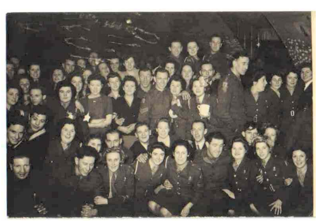
Celebrating the End of the War 1945