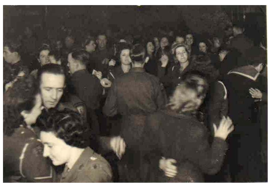
576 (M) HAA Bty – Liverpool 1945 End of War Celebrations