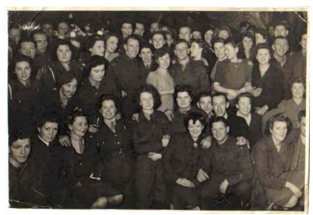
576 (M) HAA Bty - Liverpool 1945