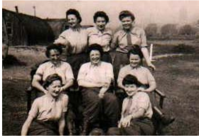
113 (M) Rocket Battery, Jersey Marine, Nr Neath - 1943